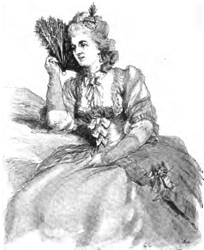
'Mademoiselle O'Faley! Copyright 1895 by Macmillan & Co.